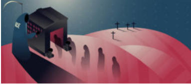
Illustration by Define Urban for Capital & Main

The documentary originally aired in April 2018 on PBS.